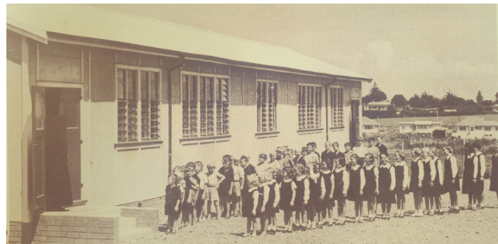
Opening of St Anne's School, February 1952

Shifting the Sisters from their home in Selwyn Street to the new Convent in Weymouth Rd was another day to remember.