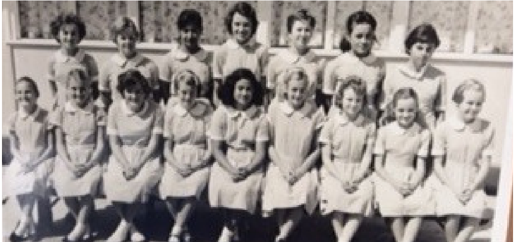
Front row L-R

The school consisted of a long block behind presbytery and church -3 classrooms and staff room. Two other classrooms were over to the right hand side of long block. The classes in those days were composite. Boys left at standard 4, and girls at form 2. I well remember when a new playing field was made, with banked grass sides - down beyond the tennis court.