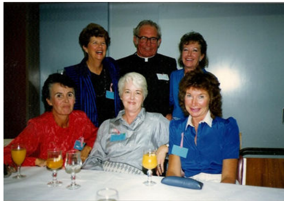
Some of the Catholic Women's League in the 1970's

The Catholic Women's League was an active lively group established in the 1970's, giving assistance and help to women and families - child minding and meals provided when mothers in maternity hospital or unwell - a Helping Hand Book recorded those willing and able to be contacted at a moment's notice when required.