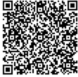
Scan this QR Code for the form

Thank you to all those who have already registered and handed in the required documents. If you would like to register your child please register via the form link or the QR code on the right . (Click here for the form)