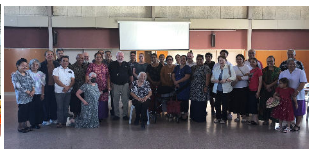
23rd March - #3 Synod Meeting