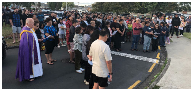
15th March - Filipino Stations of the Cross