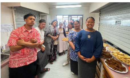
23rd March - Legion of Mary Morning tea after for 10 am Mass