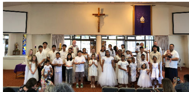
16th March - R.C.I.C Baptisms