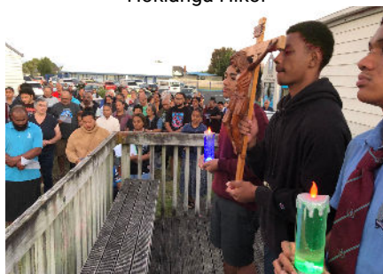
22nd March - Fijian Stations of the Cross