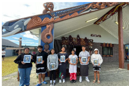
15th March - Legion of Mary in the Hokianga Hiko