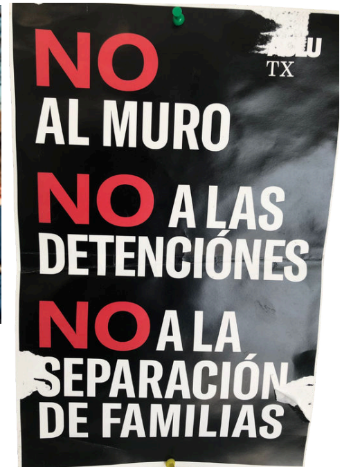
Image above translation No to the Wall No to detentions No to the separation of families