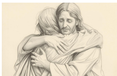
THESE IMAGES ARE THE COPYRIGHT OF SWEET PUBLISHING/FREEBIBLEIMAGES (ARTIST: JIM PADGETT)