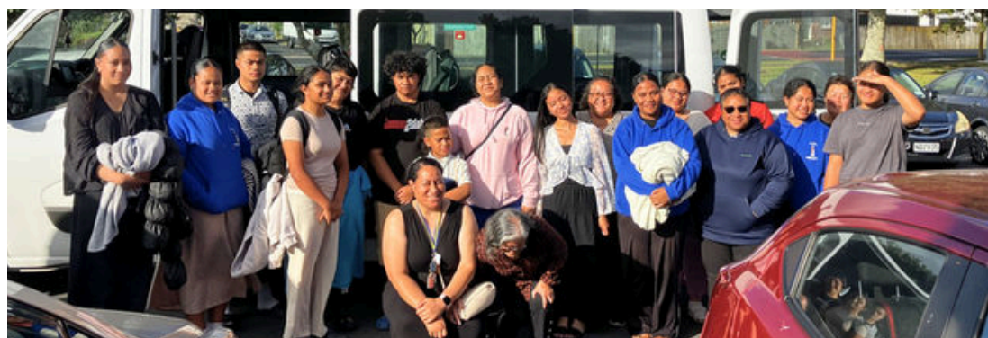
Legion of Mary coming home after their hiko