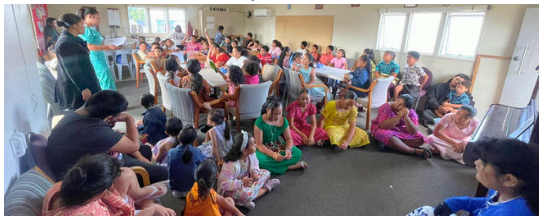
10am Mass Children's Liturgy