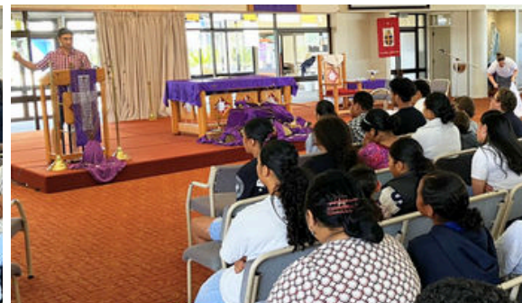
Altar Server's Training